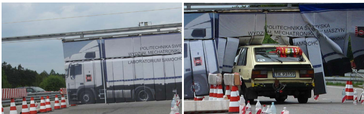
Fig. 7. Realisation of scenario III on the track (selected shots from one of the trials)