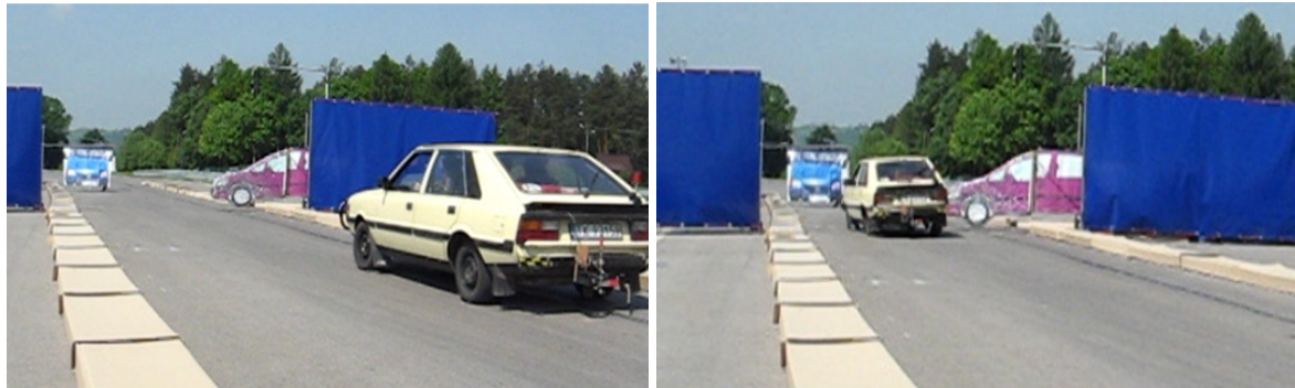
Fig. 3. Realisation of scenario I on the track (selected shots from one of the trials)