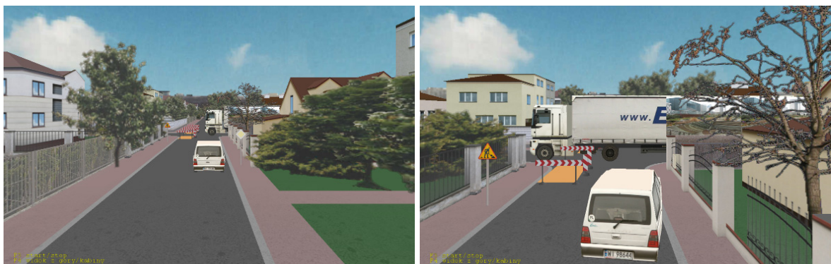
Fig. 6. Realisation of scenario III in the simulator (selected images from one of the trials)

The third testing scenario differed from the previous ones not only by the kind of the roadblock. In contrast to the earlier scenarios, in this case the choice of a defensive maneuver was eliminated. Blocking of both traffic lanes enforced the only reaction – emergency braking. The scenario was introduced after consultations with experts. In their opinion, a situation in which emergency braking is the only reaction is a frequent case in analyses of the actual accidents. The effect of traffic lanes blocking is obtained by a passage of a roadblock through the intersection and exclusion of the left side of the road from traffic using the "construction works" sign.