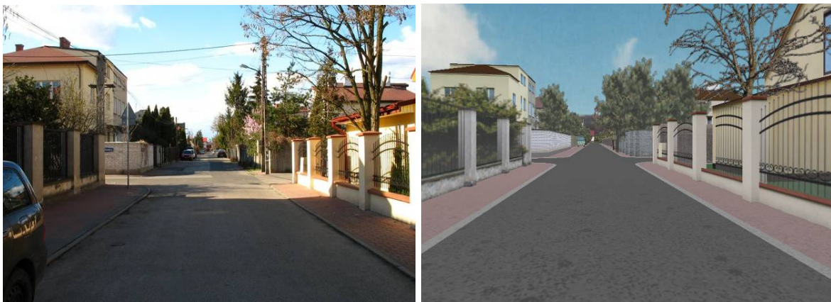
Fig. 1. Intersection of Kosiarzy and Piechoty Łanowej Streets in Warsaw (The actual image and mapping in the simulator)

Graphic capabilities of autoPW driving simulator [8], allow for graphical mapping of the actual road junction. The intersection of Kosiarzy and Piechoty Łanowej Streets, located in Warsaw, was selected for testing. The picture of the intersection and the way of its mapping in the simulator was illustrated in Fig. 1. Images of single-family houses in the simulator were built based on natural images. Also, the geometrical-spatial parameters (mutual distance, width of roadway, sidewalk, etc.) and colours were accurately reproduced.