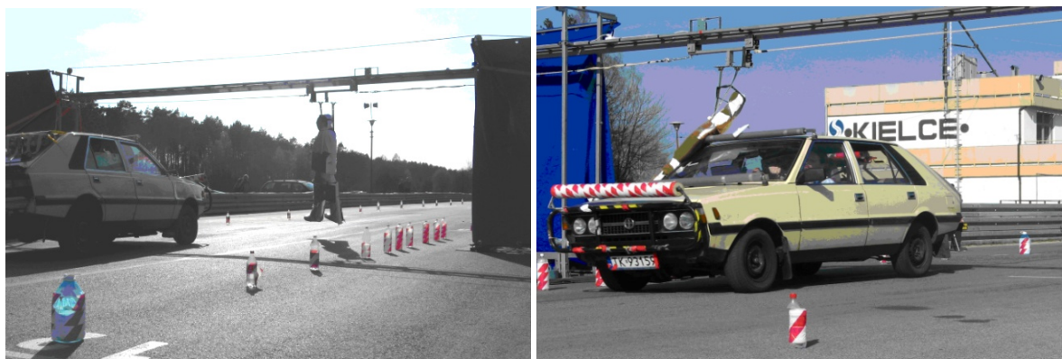
Fig. 5. Realisation of scenario II on the track (selected shots from one of the trials)

The third testing scenario differed from the previous ones not only by the kind of the roadblock. In contrast to the earlier scenarios, in this case the choice of a defensive maneuver was eliminated. Blocking of both traffic lanes enforced the only reaction – emergency braking. The scenario was introduced after consultations with experts. In their opinion, a situation in which emergency braking is the only reaction is a frequent case in analyses of the actual accidents. The effect of traffic lanes blocking is obtained by a passage of a roadblock through the intersection and exclusion of the left side of the road from traffic using the "construction works" sign.