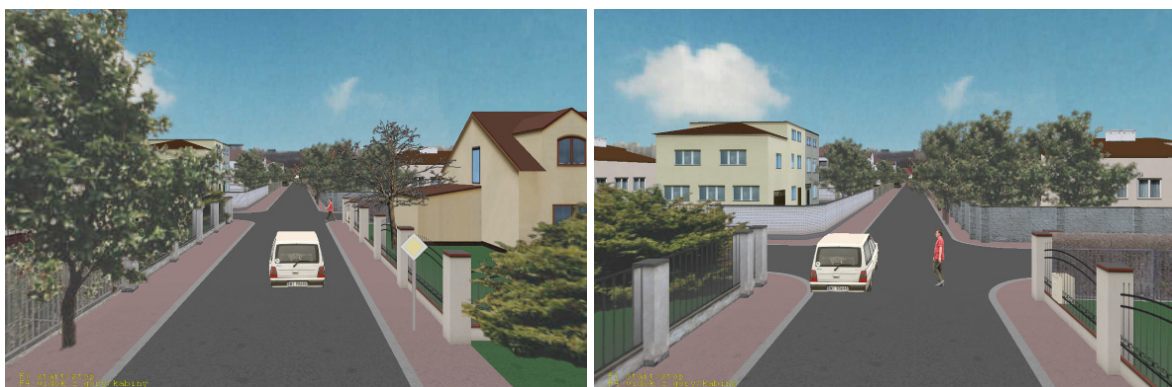
Fig. 4. Realisation of scenario II in the simulator (selected images from one of the trials)