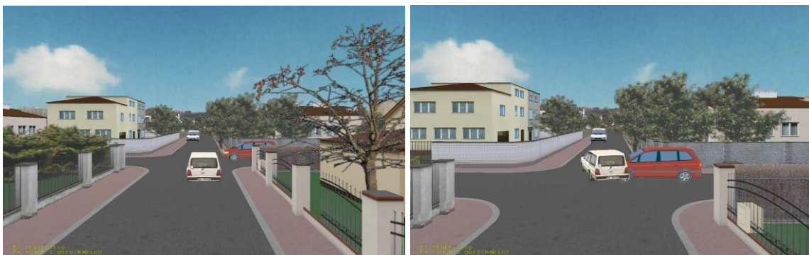
Fig. 2. Realisation of scenario I in the simulator (selected images from one of the trials)

Figures 2 and 3 illustrate sample images of the scenario I realisation in the simulator and on the track.